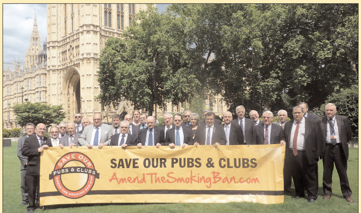
Members of the National Executive outside the Houses of Parliament.