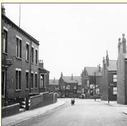
The old club pictured in 1949. and (below) the club today.