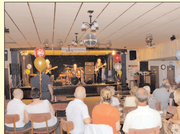
The concert room