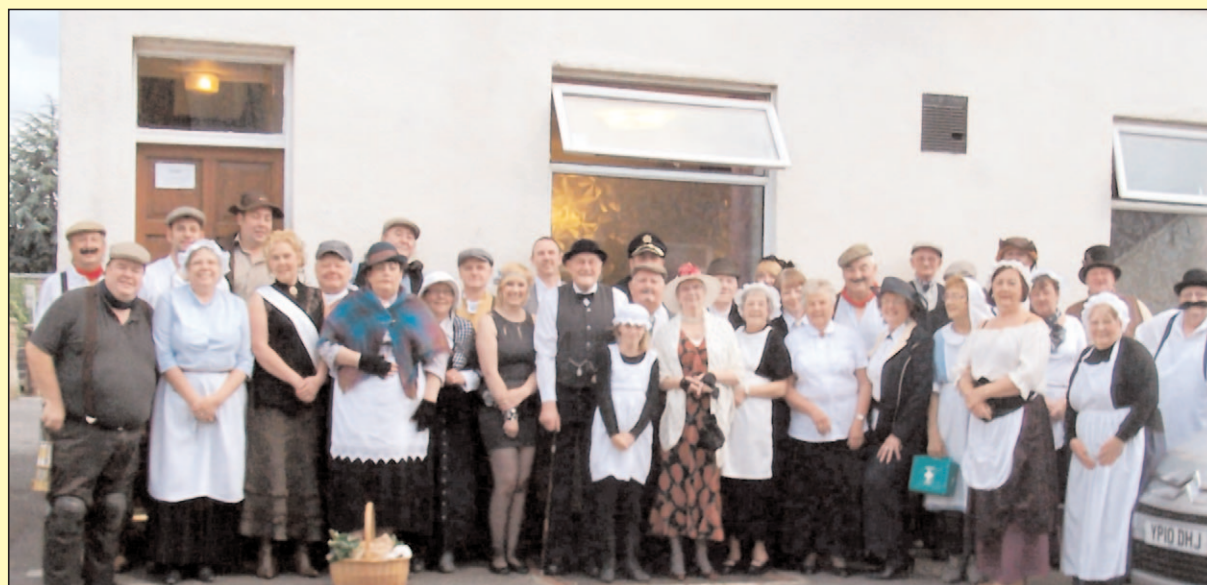
Members of Clay Cross Coronation Club don period costume for their centenary

"We are now debt-free and stable and The Committee all work hard to keep it that way — with no payment involved. For a small club like ours I think 100 years is a fantastic achievement and as Chairman I'm proud of