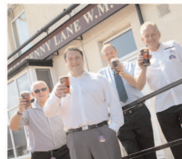
CHEERS!: Both Heineken UK and the CIU thanked everyone at Halfpenny Lane WMC for playing hosts for the event

"Our high profile sponsorship activities, both in horse racing and the world of darts, mean we can bring all the excitement of two of the licensed trade's favourite sports right