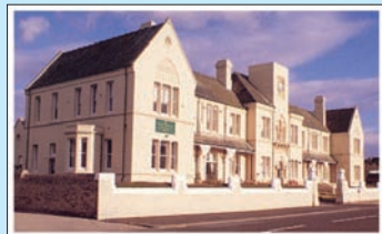
CIU SALTURNS CENTRE