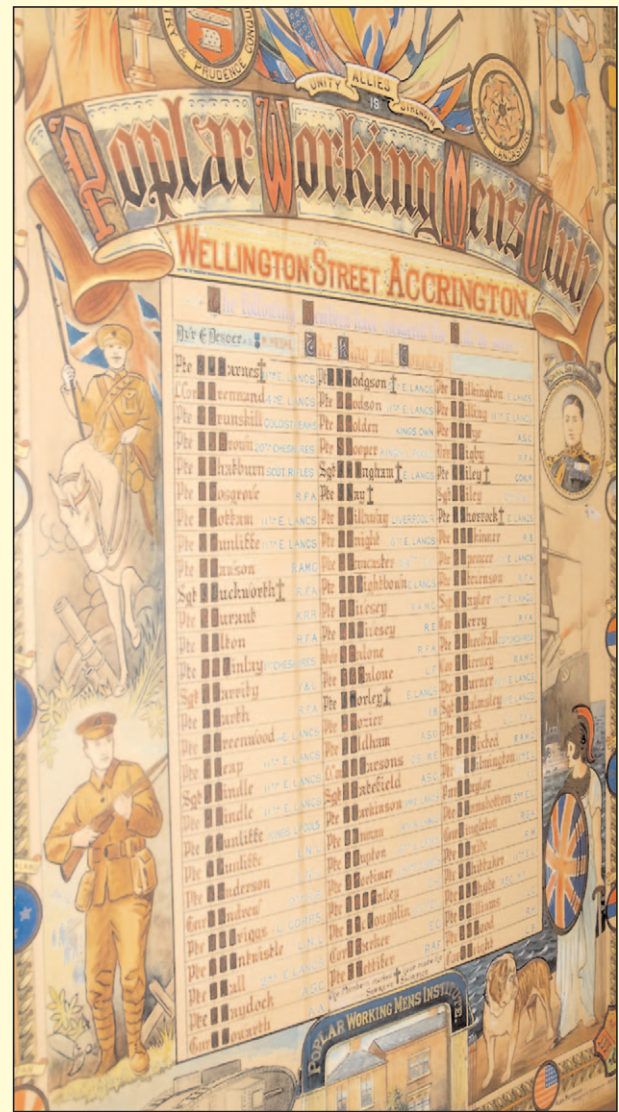
The Roll of Honour lists all 84 members who fought in the First World War.